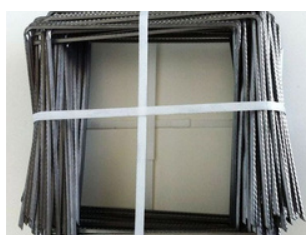
Agrafes pour toile de paillage - Ø4mm