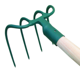
Croc à fumier 4 dents avec manche