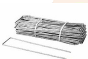
Agrafes acier pour fixation profonde - Ø6mm